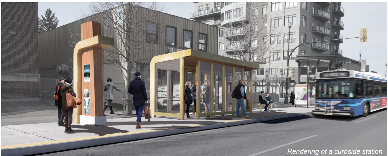
Rendering of a curbside station