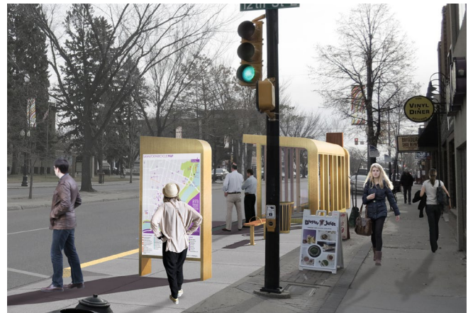
Rendering of a curbside station, with advertising display in the forefront

Congestion in Saskatoon is mainly located at intersections. In addition to TSP, there are six critical locations where bus only queue jump lanes will allow the BRT to bypass congestion.