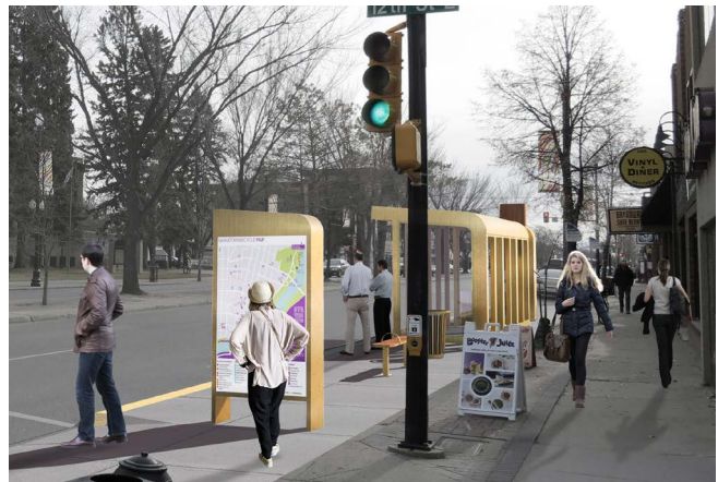
Rendering of a curbside station, with advertising display in the forefront

Congestion in Saskatoon is mainly located at intersections. In addition to TSP, there are six critical locations where bus only queue jump lanes will allow the BRT to bypass congestion.