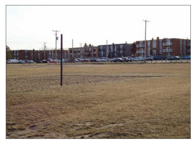
Multi-unit housing windows face a playground, but a parking lot lies between, and the distance to the playground is far beyond 75 metres, further neutralizing natural surveillance opportunities.

Providing sightlines alone when locating windows is insufficient. Too large a distance (beyond 75 metres) will make it difficult for residents to see anything and unlikely they will take action if necessary. In addition, if there are other land uses between the windows and the place to be observed, for example a parking lot between windows and a children's playground, it will distract viewers and impede natural surveillance.