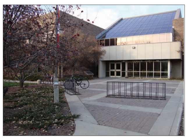
Window sight lines will enhance surveillance, in this case of bike stands.

Front foyers are a natural area to provide ample sight lines outside the building. This is often where security officers or reception desks are located. Not only will they appreciate the open view and light during their work hours, they are ideal individuals for keeping an eye on activities outside.