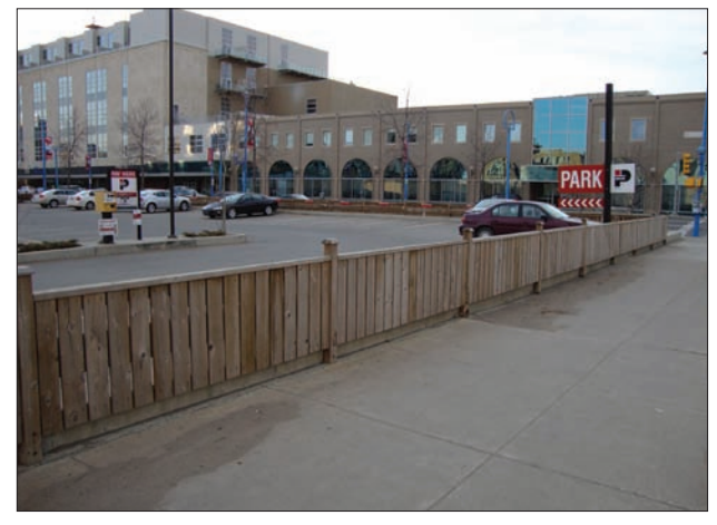
Locating parking near occupied windows enhances natural surveillance.

It is not always possible to know all the land uses, or their configuration, in an area. Wherever possible, however, consideration should be given to placing parking lots near adjacent windows.