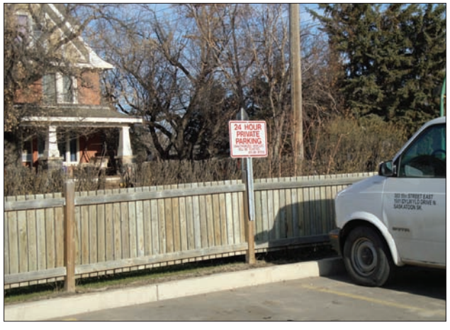
The property owner has installed mid-level fencing that is easy to see over and combined it with instructional signage. The hedging must be kept trimmed in order not to obstruct sightlines in summer.

Fencing in urban areas can be 1.0 metre in height and still provide good natural surveillance. In remote areas higher fencing may be appropriate.