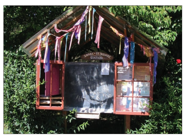
This community bulletin board was designed by the community and is well used and free of vandalism.

11.2 Application – Community bulletin boards are one way to offer a public service and also a place where people may go to find information.