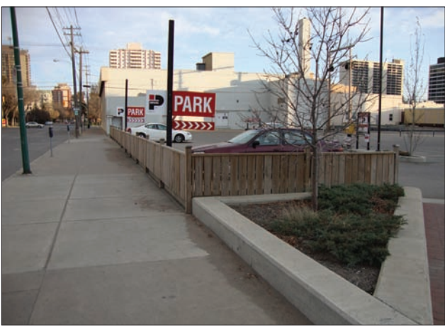
Surface parking signage.

Surface parking lots require ample, clearly visible, and well-lit signage for both pedestrians and vehicle users. The signs should indicate route directions and instructions for pedestrian users, such as helping shoppers locate their cars at shopping plazas. Colour-coding directional signs, or using an easy-to-remember theme, will help. Signs should also clearly mark vehicular routes, entrances, and exits.