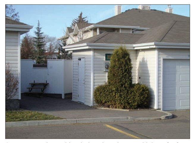
Storage area in multi-unit housing that would benefit from better siting or CCTV.

In cases where design cannot mitigate risks it may be necessary to install CCTV security cameras. Monitoring the image is very effective if it is made directly available to the owner of the property under surveillance. Owners can then follow an established protocol to contact security or police if they view someone breaking into the storage area.