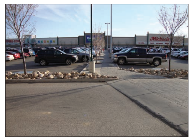
Here the owner created a walkway through the parking lot with landscaping trees and a curbed, raised surface (although it is a bit too narrow to allow walkers to pass comfortably).

Design pedestrian routes within parking lots. Use lighting, pavement marking, and signs to direct people to exits and entrances. These parking lot sidewalks will help minimize conflicts between pedestrians and drivers.