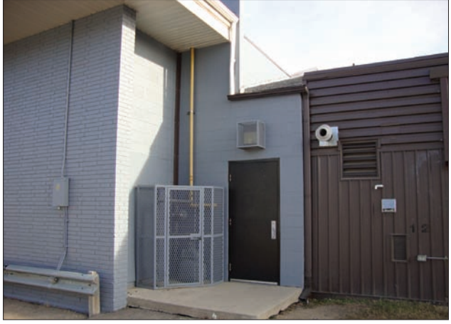
Unintended access to the roof at the rear of a property due to the placement of screens and roof overhangs.