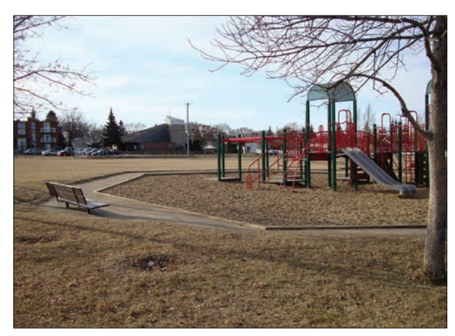
A children's playground is demarcated by a walkway and a small, raised edge. Beyond is a sports field for teenagers.

This requires that the intended use of the area be clearly defined with appropriate borders as necessary. The physical layout of the space should match its intended function and it should also be evident which activities are appropriate to the space and where. A lack of clarity here is confusing to users and can encourage illegitimate activities.