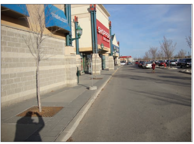
A mall uses green and ornate fixtures and lamps for branding.

Commercial branding includes malls seeking to create a distinctive look. The branding will typically extend to all areas of the mall and link all the shops together through some theme.