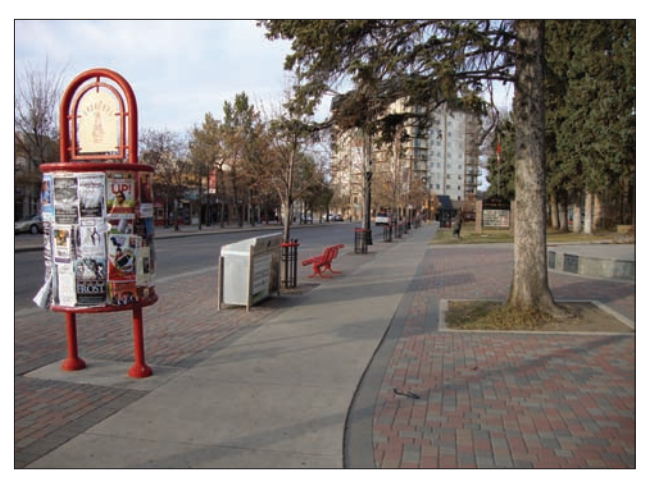
Bench seating, a community bulletin board, and recycle/litter containers fit into this public rest area without impinging on the public sidewalk.

Sometimes differentiating use can be accomplished by consolidating related activities, for example, combining seating, community bulletin boards, litter containers, and bus stops at a single location.