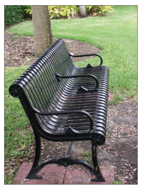
Park benches can be designed to deter overnight sleeping.

There are a number of strategies that might apply, depending on the risk assessment and the objective of the designated space. For example, in-ground sprinkler systems can be scheduled to water lawns during evening hours thereby displacing illegitimate users and discouraging loitering. Another example is to use benches that do not support the illegitimate use by skateboarders or vagrants. The bench below is not attractive to skateboarders and is also difficult to sleep on.