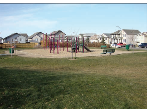
Benches are visible to the surrounding residential and allow easy monitoring of the play area.

Bench seating adjacent to a playground allows parents or care givers to supervise their children while they play. Litter containers are also provided. Even older-style wooden bench seating is helpful, though it tends to be more vulnerable to vandalism and wear.