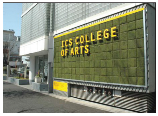
Moss covering the entrance wall to a college provides an excellent and attractive green screen.

Greenscreens can be used on any type of wall in any location. They require little maintenance or watering.