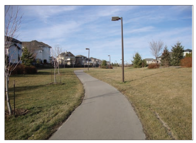
Surfaces should be durable, even, and smooth for easy use.

Select walking surface materials for smoothness, stability, and durability. They must be non-slip in wet conditions and should not reflect lighting or create glare conditions when wet.