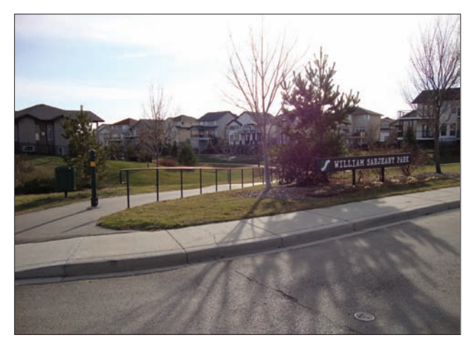
Entrance signs help identify a neighbourhood linear park.

It is important that large, clear, and readable signs be positioned at the entranceways to walkways and linear parks. If they include a map, they should be oriented so that they are consistent with the direction the walker faces when looking at the sign.