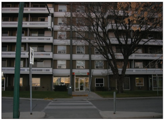
Mixed use residential complex.

A dentist and doctor's office fill the main floor of this multi-unit residential development.