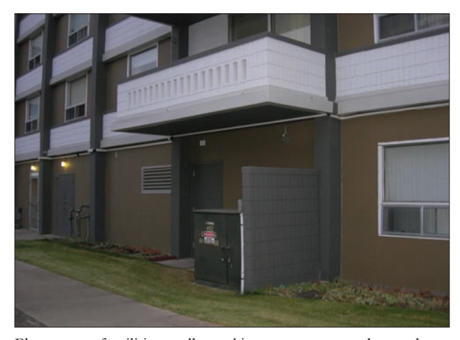
Placement of utilities, walls, parking structures can be used as a ladder to access units.

Design out burglar ladders that allow easy access to rooftops, ledges, and balconies.