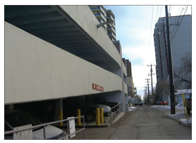
Pedestrians in this lane are forced past numerous entrapment spots and dark areas along the sides creating a gauntlet they must walk in order to get to their destination.

These feelings of isolation and discomfort occur when movement predictors force people through areas where they may fear risks to themselves.