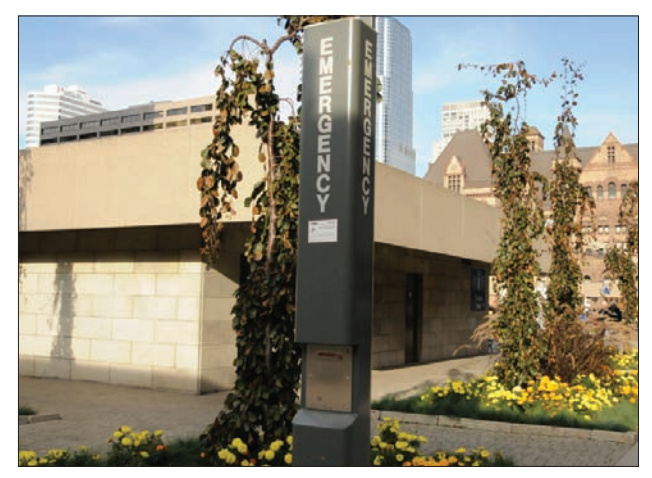
Emergency devices come in many types, and shapes. One version is a stand alone call-button that is linked directly to emergency services.

Locate public telephones and emergency telephones in obvious locations on institutional grounds. Use signs to illustrate where they are located. Video cameras and patrols can also be helpful if the areas are quite large. University campuses often employ panic buttons and telephones that connect directly to security as well as 24-hour patrols to support users.