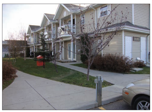
Multi-unit walkways can enhance movement around a property and add to overall aesthetics.

For example, locating walkways adjacent to storage area doors means that residents will walk by vulnerable property and provide informal surveillance.