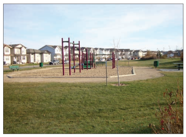
In this playground edges are defined with landscaping ties and a gravel walkway.

Provide a clear territorial definition along the edges of parks, recreational areas, or playgrounds. Take care not to use stones that can be thrown against windows or raised edges that will be damaged by snow removal equipment in winter. Edges can be defined through different ground cover, grass, and edgings like landscaping ties.