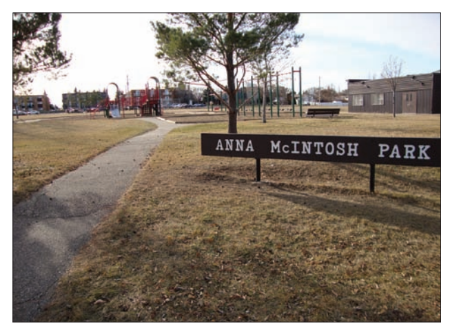
Signage is important. Naming the playground, recreational area, or park after someone from the local neighbourhood can help enhance local ownership.

Large, easily read signage at the entranceways to parks, recreational areas, and playgrounds is important for users' wayfinding and for establishing the use of the area. The signs should include a name of the park, maintenance, emergency numbers, and any other information established by the City of Saskatoon. They should also be high enough so they are not blocked by landscaping material or snow during the winter months.