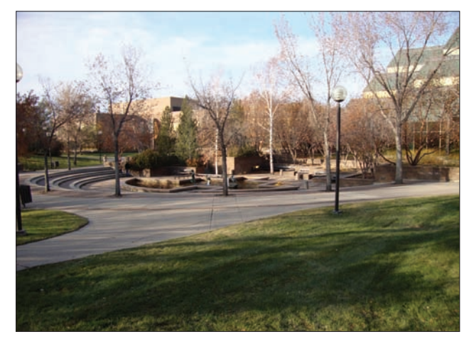
These buildings face a public open space that draws people from adjacent buildings.

Institutional land uses have a unique role and may include buildings providing government services, facilities conducting scientific research, or educational or medical buildings. However, there are a few design guidelines that will help safety and crime prevention. One is the orientation of buildings.