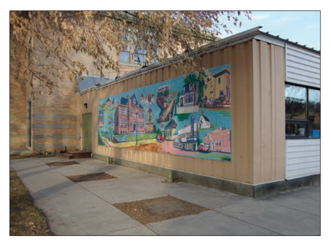
The most effective murals in public spaces are those designed and painted by members of the community.

Long blank facades can create a sense of isolation and reduce territoriality; especially along the walls of large buildings. Where possible, the goal of design should be to create attractive landscaping features or large artistic wall murals.