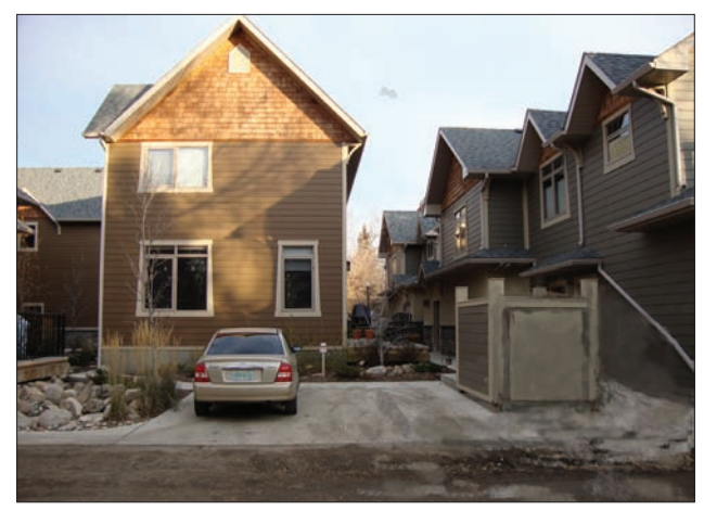
Car-theft opportunities are reduced by locating small numbers of clustered parking spots with ample natural surveillance from owners' units.

The tendency to create large parking lots for multi-unit housing allows for unsupervised spaces where thieves will target their crimes. These crimes can be reduced by clustering parking into smaller areas near natural surveillance opportunities.