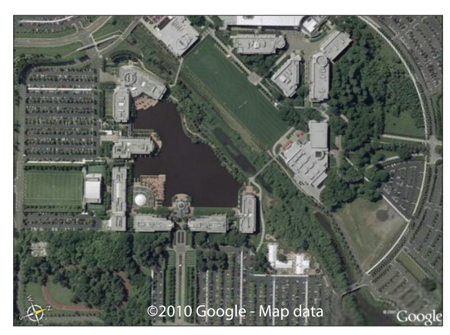
Combining institutional and recreational uses support each other.

The addition of recreation facilities such as soccer and football fields, tennis courts, and walking paths to the NIKE Headquarters site in Portland, Oregon adds value for their employees. These recreation facilities can also keep the area vibrant and active past the normal week day as well as through the weekend. Extending use of these facilities to the surrounding community also creates a stronger connection and has the potential to increase natural surveillance of the area by all users.