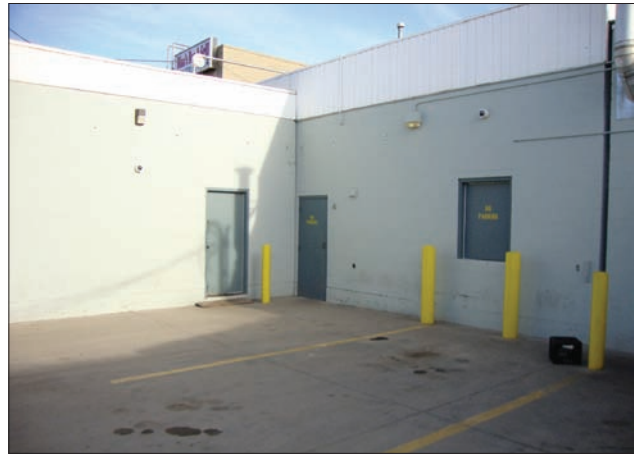
In this case the designer has eliminated roof access and installed secure doors and CCTV on the walls to protect the property.