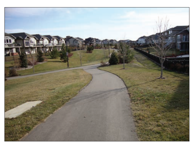
Linear parks or walkways require edge definition, in this case a medium-sized fence and low grass berms.

Provide a clear definition between walkways and planted areas or shrubs. Edging with pavement treatments, mulch, or other similar materials can help keep people off landscaped areas and visually beautify a walkway.