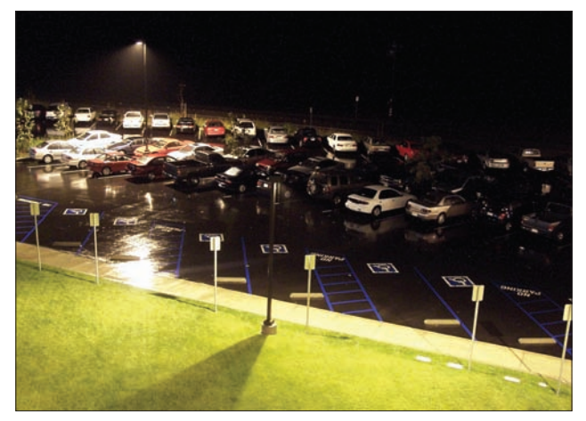
Uneven lighting can endanger users and reduce feelings of safety.