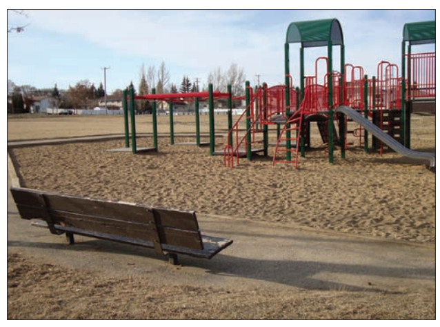
Older style benches are effective as well.