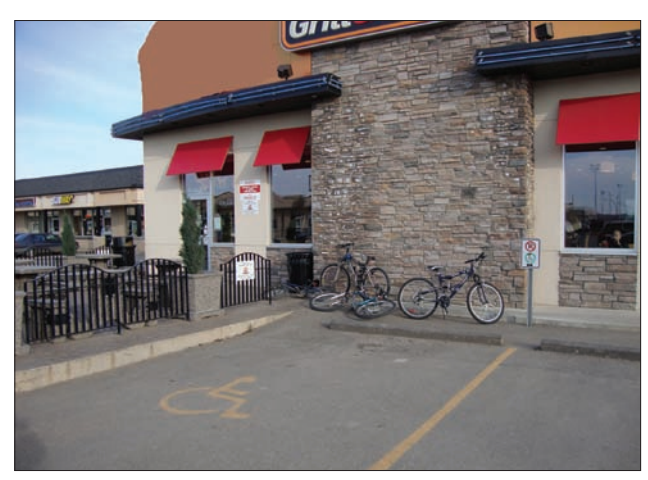
Bicycles should have a bike stand.

Where bicycle stands are not provided, bike owners may be forced to leave them unsecured and vulnerable to theft when they walk into public stores or other venues. Providing bicycle stands can reduce theft levels.