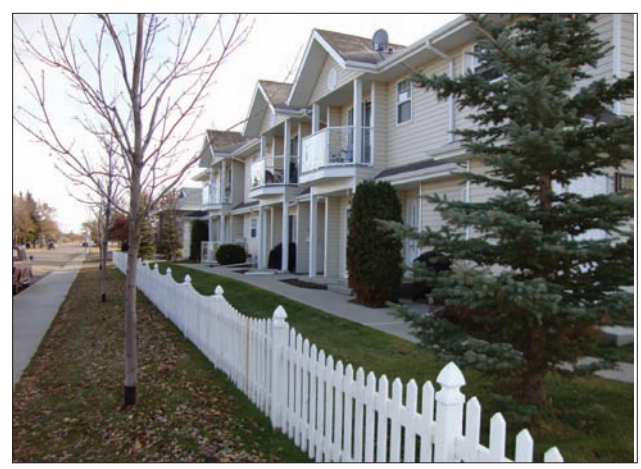
Good design adds value to a housing development.

Visual complexity in design, teritorial fencing, and other site details can help bring a sense of pride and aesthetic appeal to a multi-unit residential development.