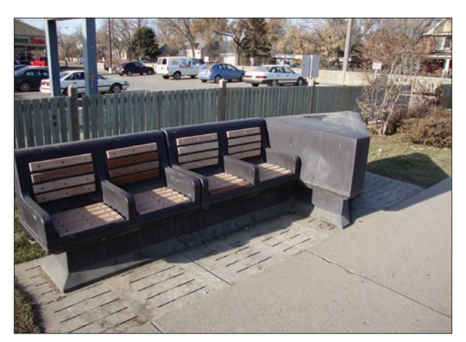
Appropriate bench seating at a bus stop adjacent to a surface parking lot. The bench is clean and provides a litter container as part of the structure.

Seating or benches can be attractive features if they are well designed and maintained. They should be located in highly visible locations near exit and entry points, near entrance kiosks, or adjacent to landscaping features.