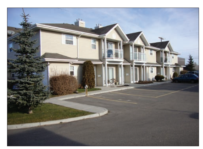
An additional view of a multi-unit residential site that fits with the surrounding area.

Colour, shape, massing, and architectural style are features that help multi-unit residential housing fit in to the surrounding neighbourhood.