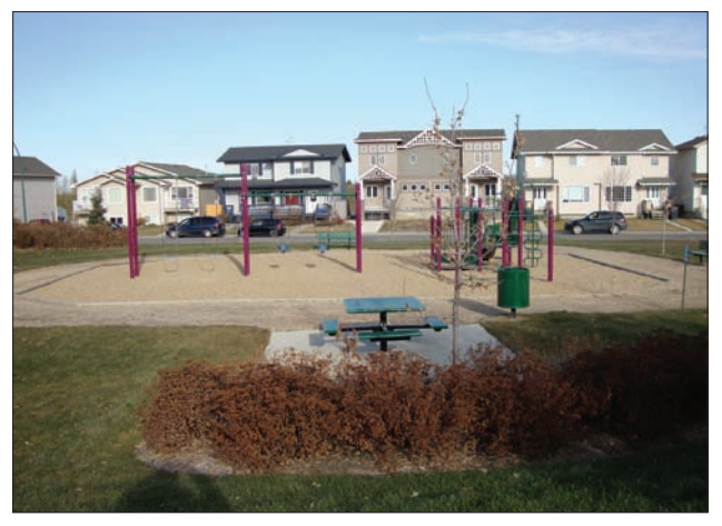
Windows from homes face a playground across a street, however in this case the distance is fairly close and it provides easy sightlines.