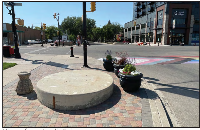
View of empty plinth in summer season