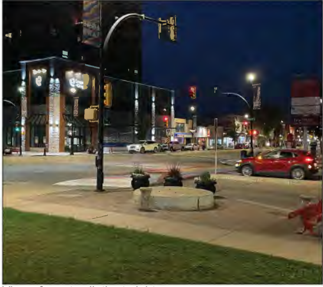
View of empty plinth at night.