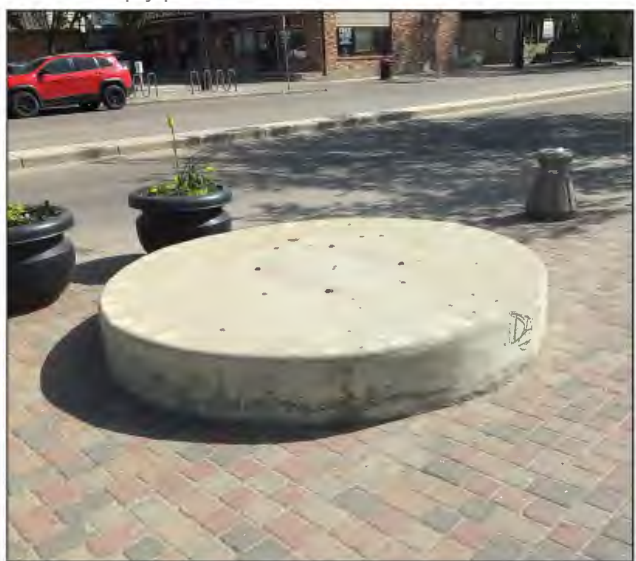
View of empty plinth in summer season.