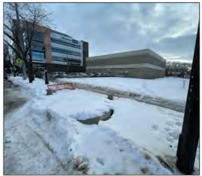
View of empty plinth in winter season.