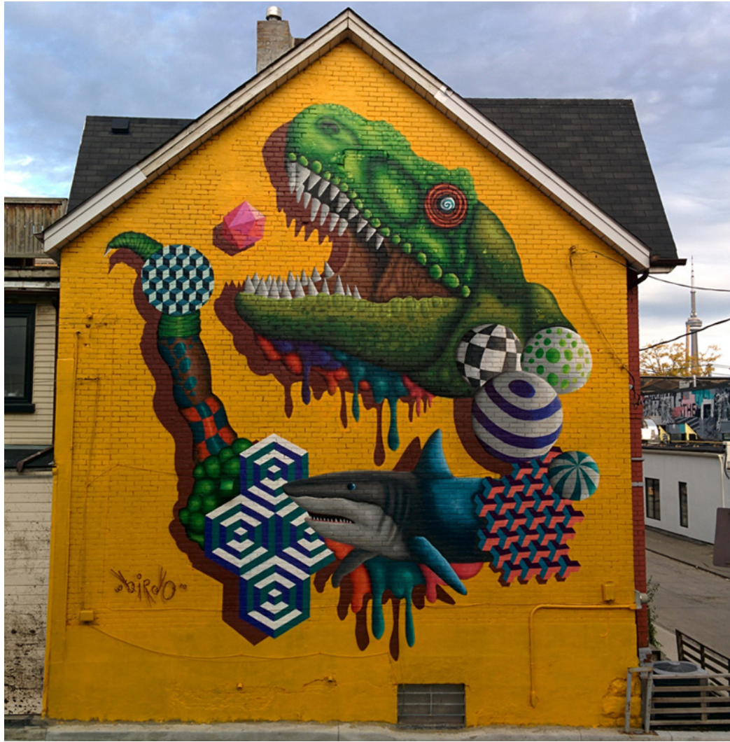
2. "TorontoSharkus-Rex" - Aerosol on brick - 20 ' X 30' - Toronto, September, 2015