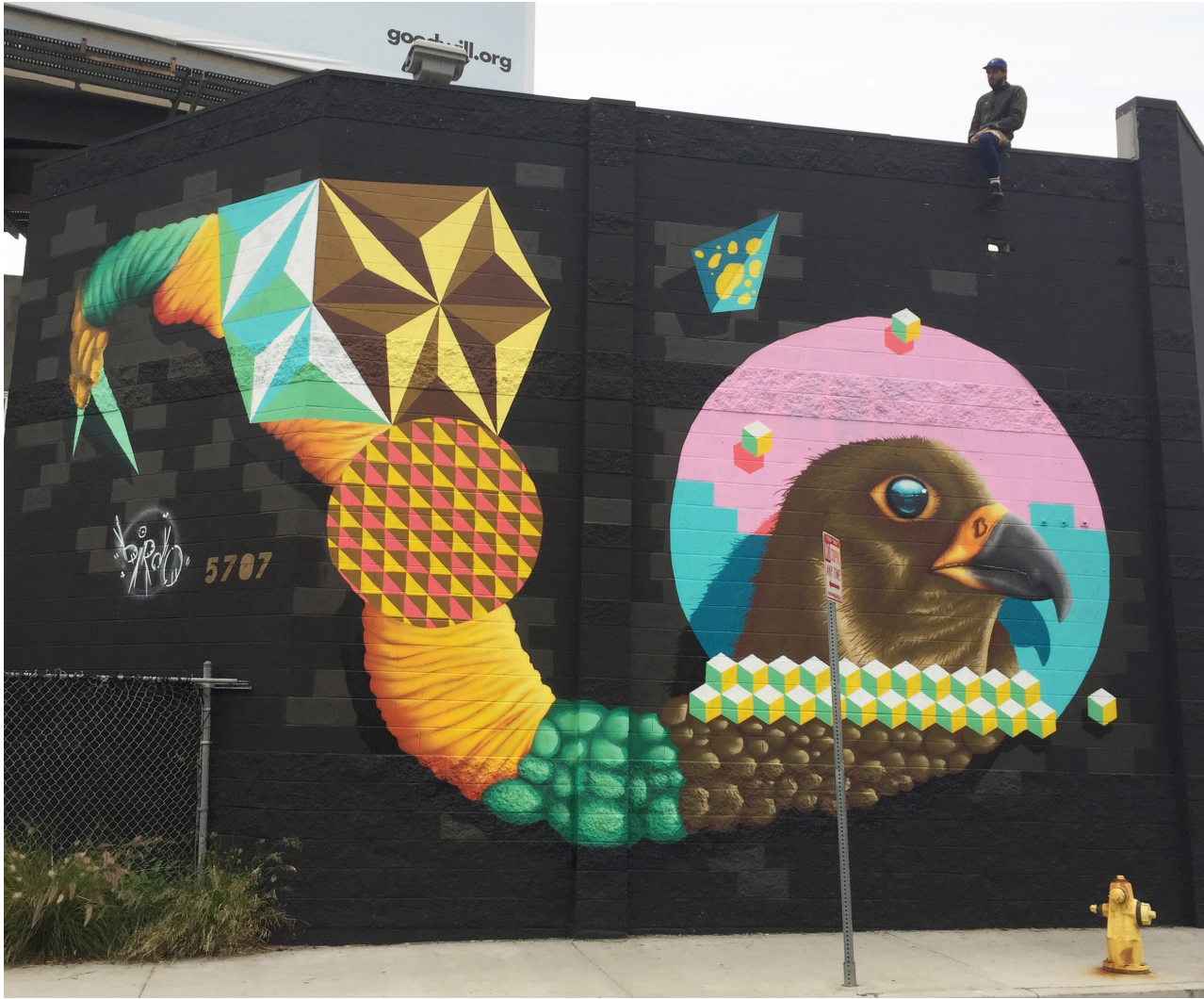
8. "M-rad Architecture" - Aerosol on Cinder block - 50 ' X 25' - Los Angeles, March, 2016