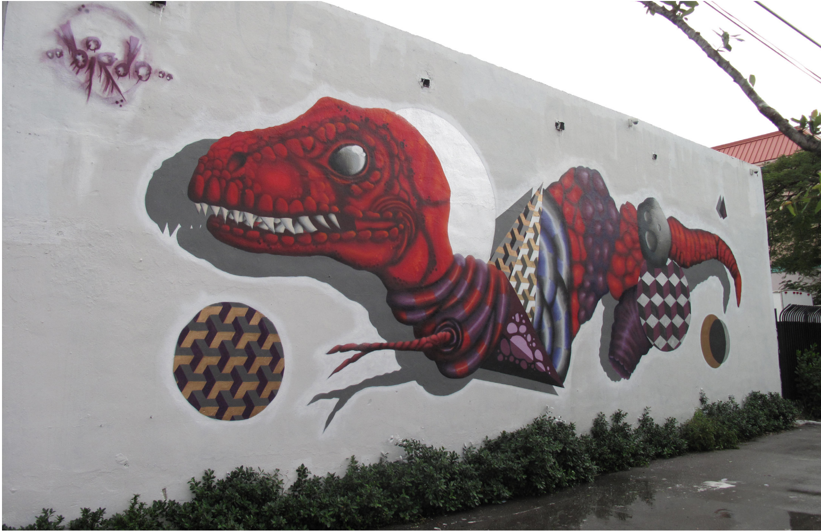
5. "Go Raptors" - Aerosol on Plaster - 30 ' X 20' - Miami, December, 2015