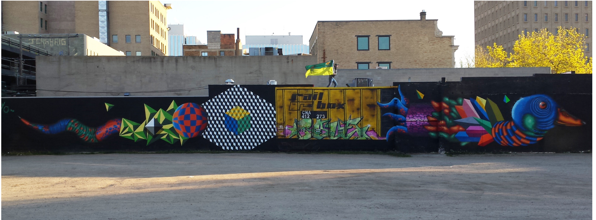
6. "Prairie Boy" - Aerosol on Cinder block - 100 ' X 20' - Saskatoon, July, 2015