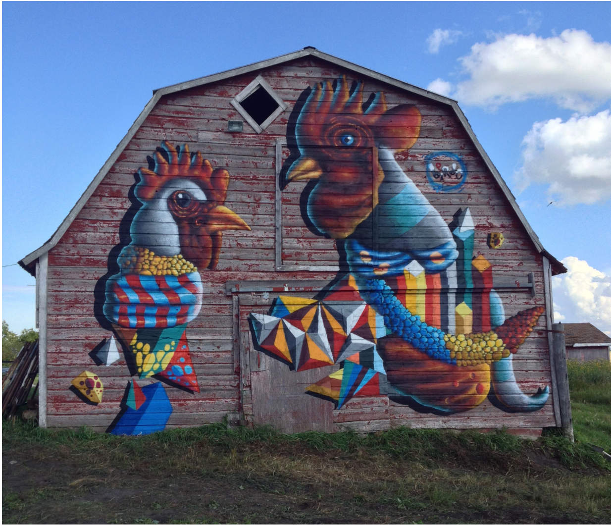
7. "Barn Yard" - Aerosol on Wood - 20 ' X 20' - Foam Lake, August, 2014