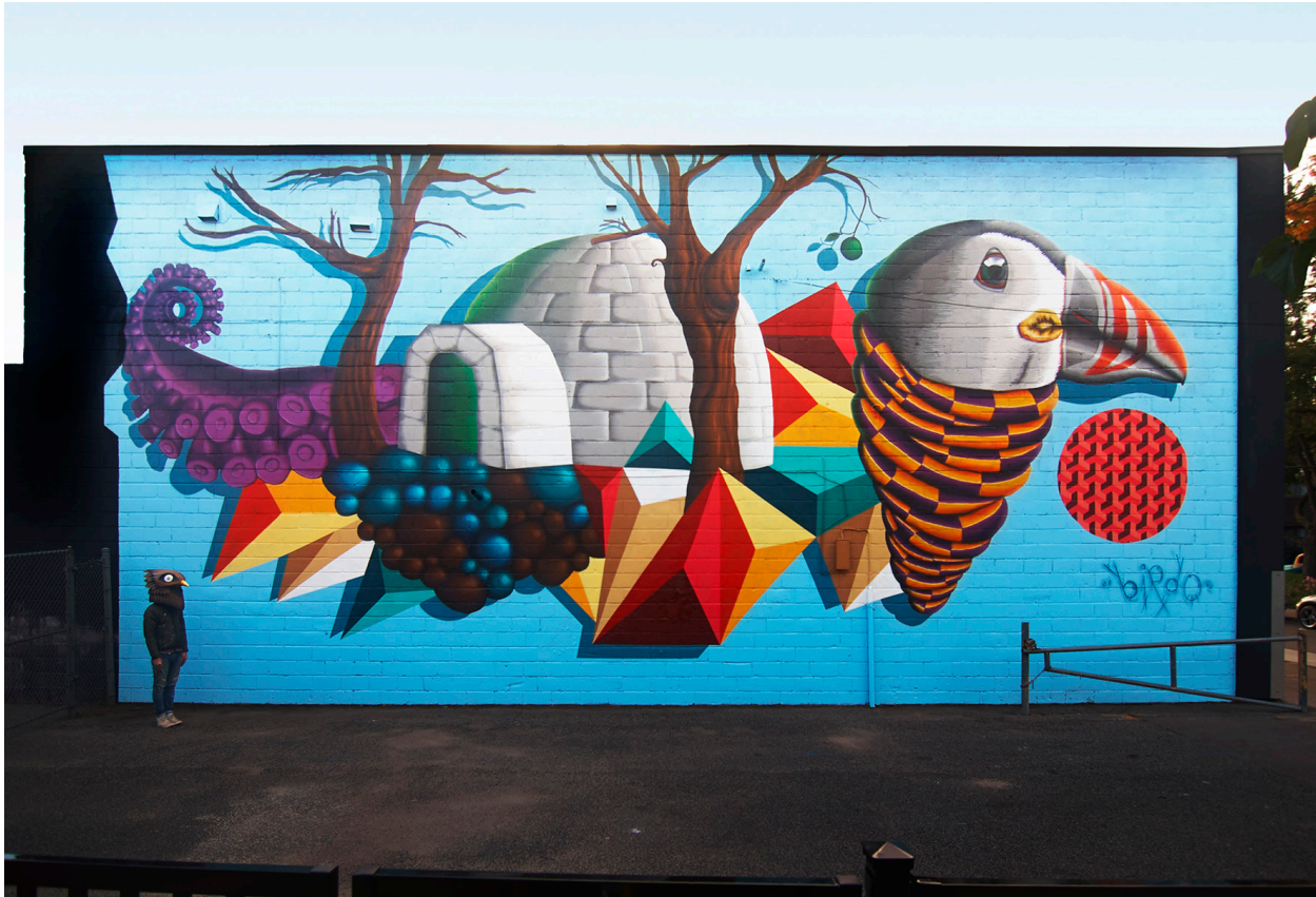
1. "Earth Puffin" - Aerosol on brick - 70' X 30' - Toronto, August, 2015