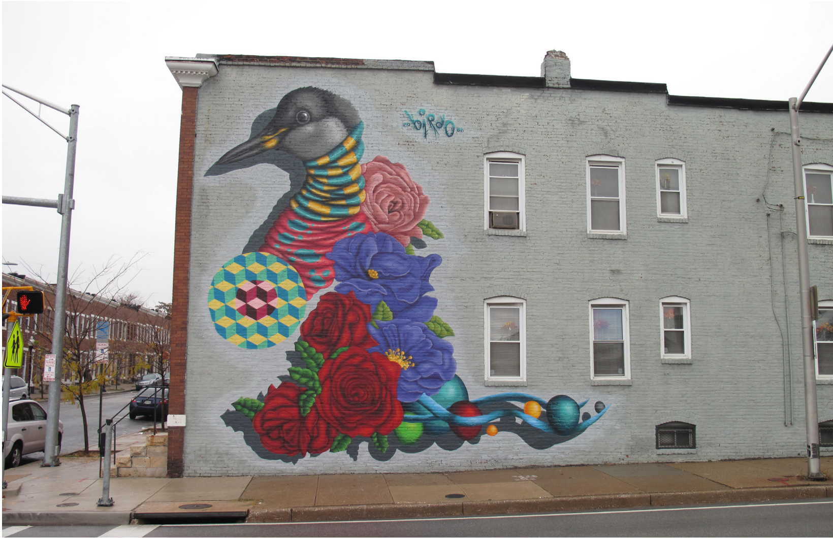
4. "Mural of Hope" - Aerosol on Brick - 25 ' X 30' - Baltimore, November, 2015