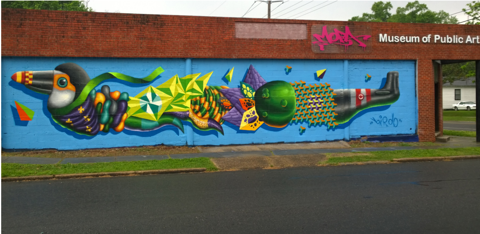
9. "Baton Rouge Guest" - Aerosol on Cinder block - 40 ' X 12' - Baton Rouge, September, 2015