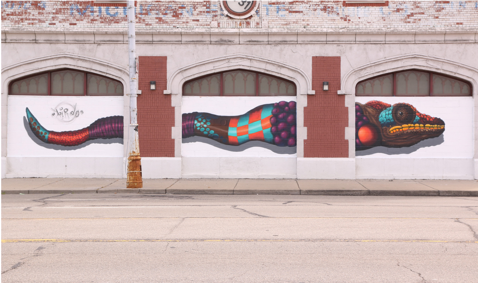
10. "Creative Creature Corridor" - Aerosol on Cinder block - 40 ' X 12' - Detroit, October, 2015