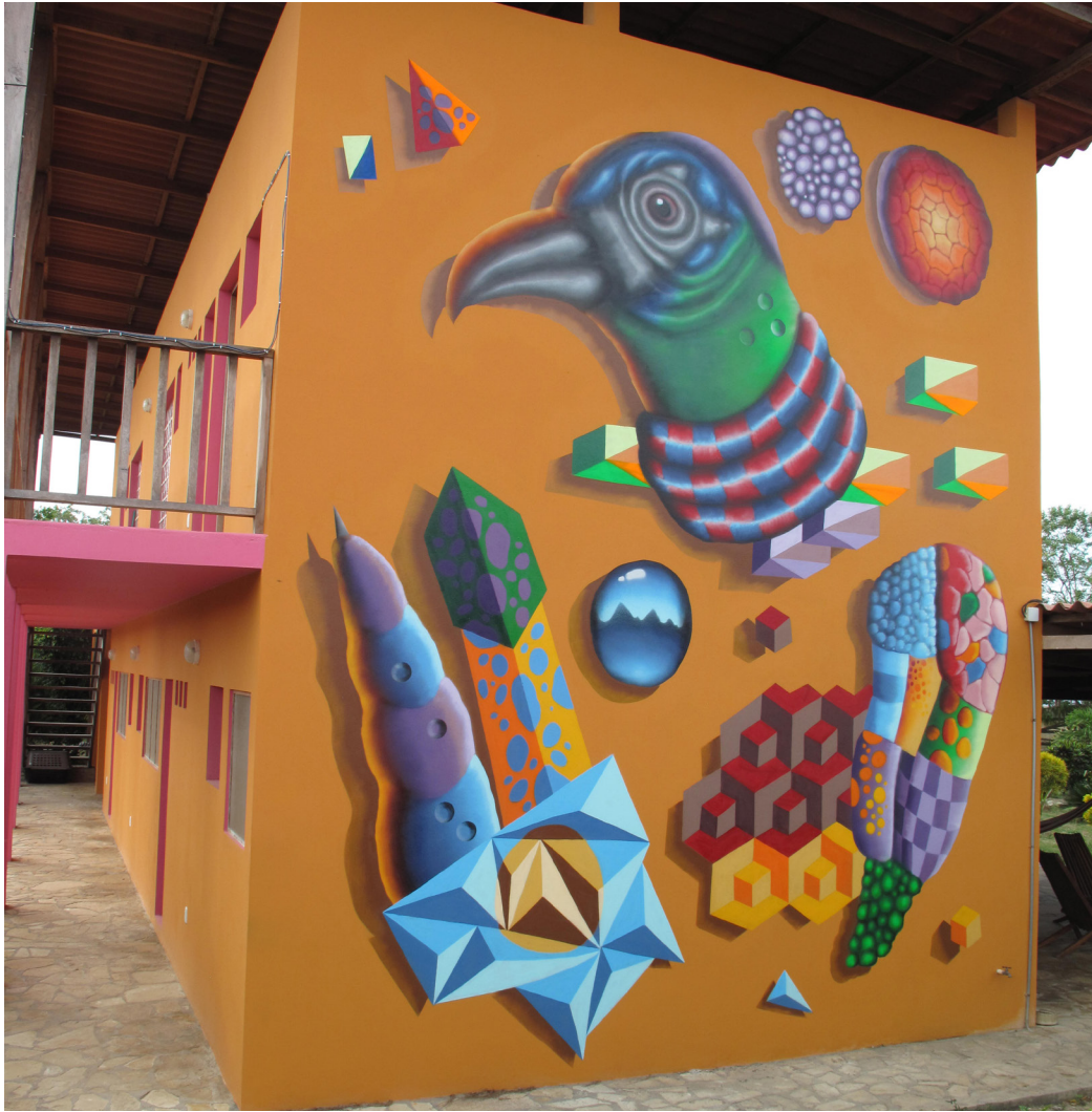
3. "Mot Mot" - Aerosol on plaster - 15 ' X 22' - Nicaragua, December, 2014