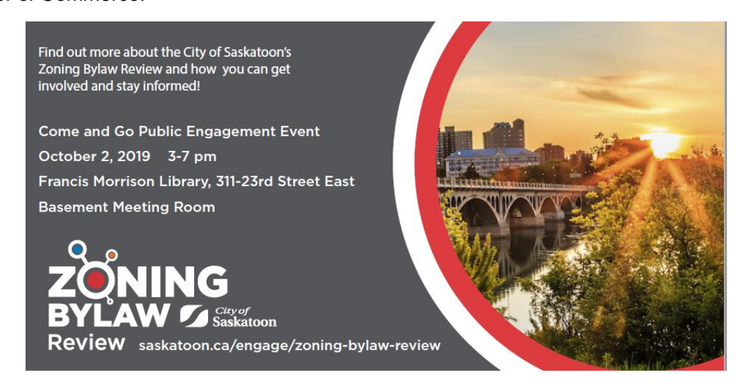
Figure 5: Materials Sent To Chamber Members

703 people received an email invitation from the City to the open house, and 713 people received a reminder email about the event. An e-blast was also sent to all members of the Great Saskatoon Chamber of Commerce.