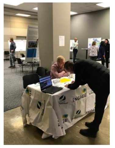
the start of the event. Four people did not sign in, 10 identified with local neighborhoods, 31 identified as participating in their professional capacities (8 of these were employees of the City who were not working at the event), and one City Councilor attended.

Opportunities to provide online feedback are still open, so there may be additional participants for this initial phase of engagement.