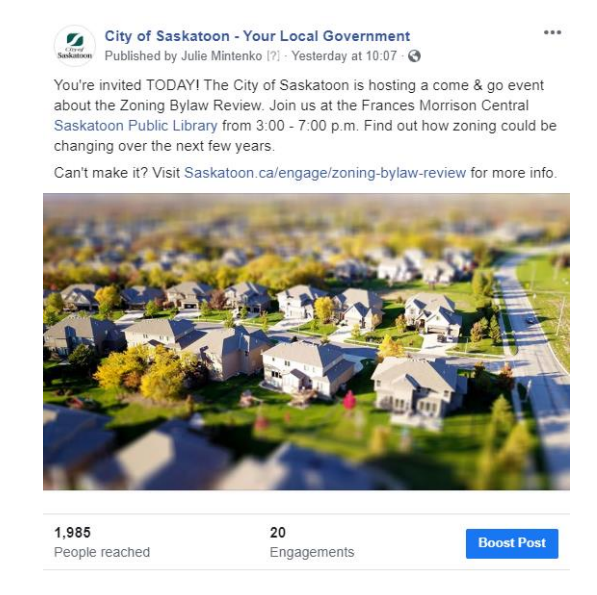
Figure 4: Facebook Promotion