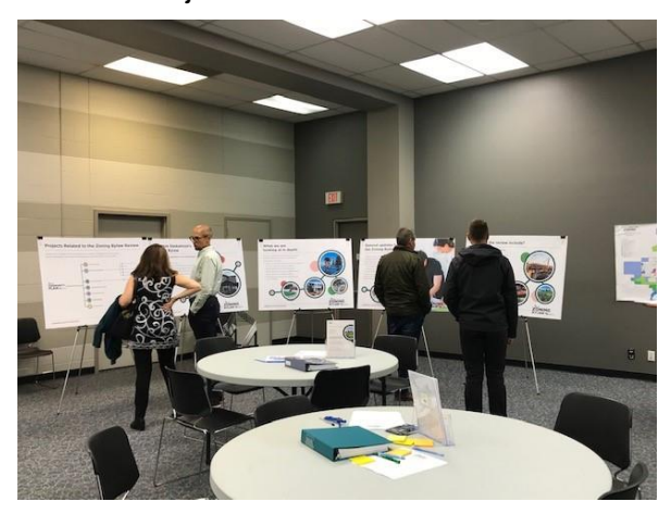
Figure 1: Open House

A public open house was held at the Frances Morrison Central Library on October 2, 2019 from 3:00 pm to 7:00 pm. The public was invited to view the list of topics that have been identified to be included in the Project and provide feedback. The Open House was also an opportunity to discuss the Project with the Project Team as well as other community members.