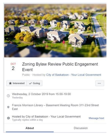
Figure 3: Facebook Event

The Facebook event page for the open house reached 1.3 thousand people on Facebook. The event was additionally promoted using Facebook and twitter. Facebook reminders reached 1,985 people.