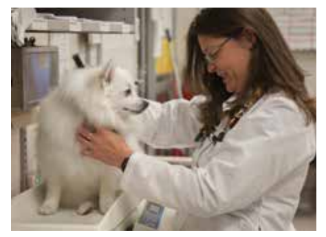
Vaccinations are an important part of pet ownership. Recommended vaccines include rabies, canine distemper, parvovirus and infectious canine hepatitis.