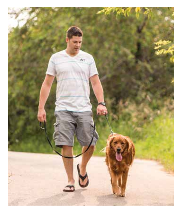
A bylaw amendment approved by City Council in October, 2021, now allows on-leash licensed dogs and cats to visit Kiwanis Memorial Park with their owners.

To ensure you and your pet are up to date, go to Saskatoon. ca, click on "Services for Residents" and click again on "Pet Licensing & Animal Services." You can also go to the quick link at Saskatoon.ca/ animalservices .