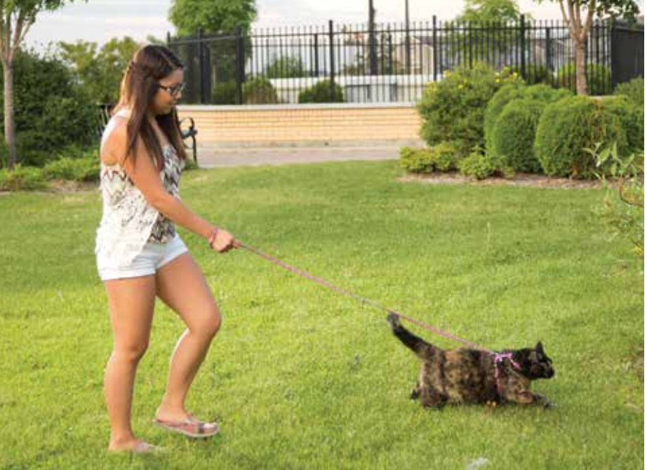
Training your cat to walk on a leash is a safe way for your feline to enjoy the outdoors.

"It's good to remember that collars, leashes or other training tools are all inanimate objects and efficacy depends on the user.