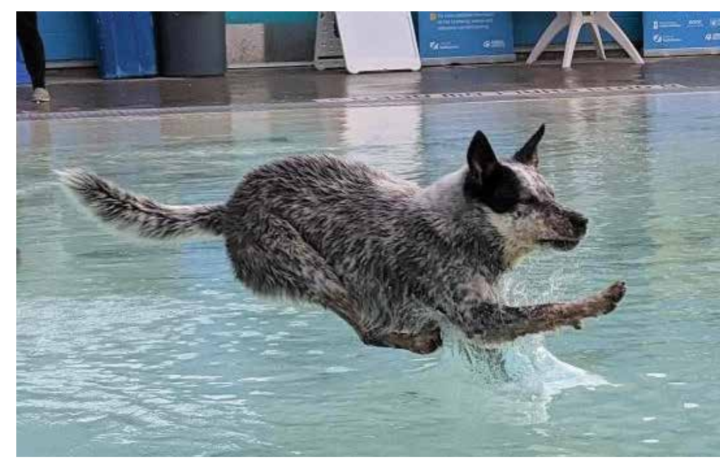
The annual Dog Day of Summer pool party for licensed dogs returns to Mayfair Pool on Tuesday, August 23. The event is open to well-socialized dogs with a valid license and up-to-date vaccinations.