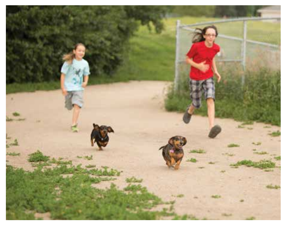
Two small dog-only off-leash parks are being considered for development in Saskatoon.

To find out more about the proposed park locations, visit the Dog Park for Small Dogs page on Saskatoon.ca/engage .