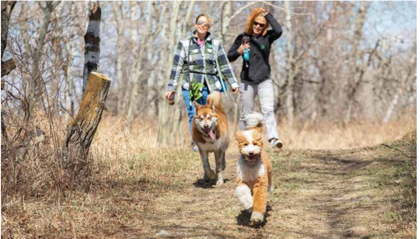
Revenue from dog and cat licenses helps develop and maintain the City of Saskatoon’s 11 off-leash dog parks in Saskatoon.