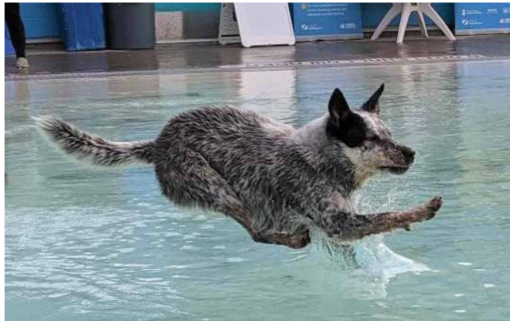
The annual Dog Day of Summer pool party for licensed dogs returns to Mayfair Pool on Tuesday, August 23. The event is open to well-socialized dogs with a valid license and up-to-date vaccinations.