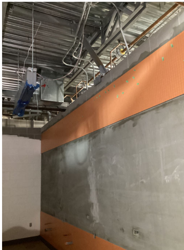
Female Change Room: Wall tile installation; new metal deck and open-web steel joist system in place; HVAC and electrical rough-ins ongoing