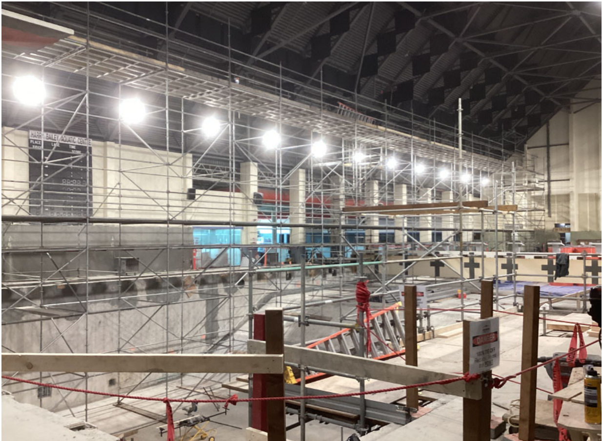
General site view: Scaffolding erected for installation of new pool HVAC system