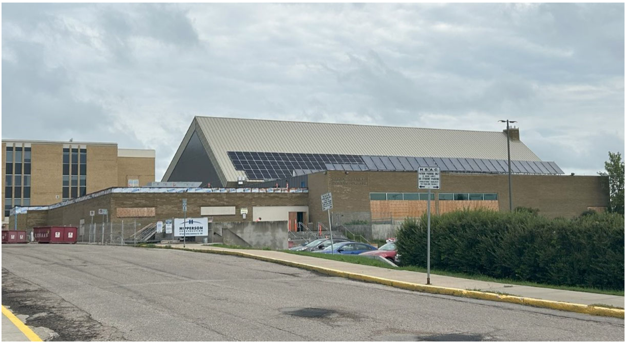
General view: Roof membrane tied into existing wall membrane; solar panels installed