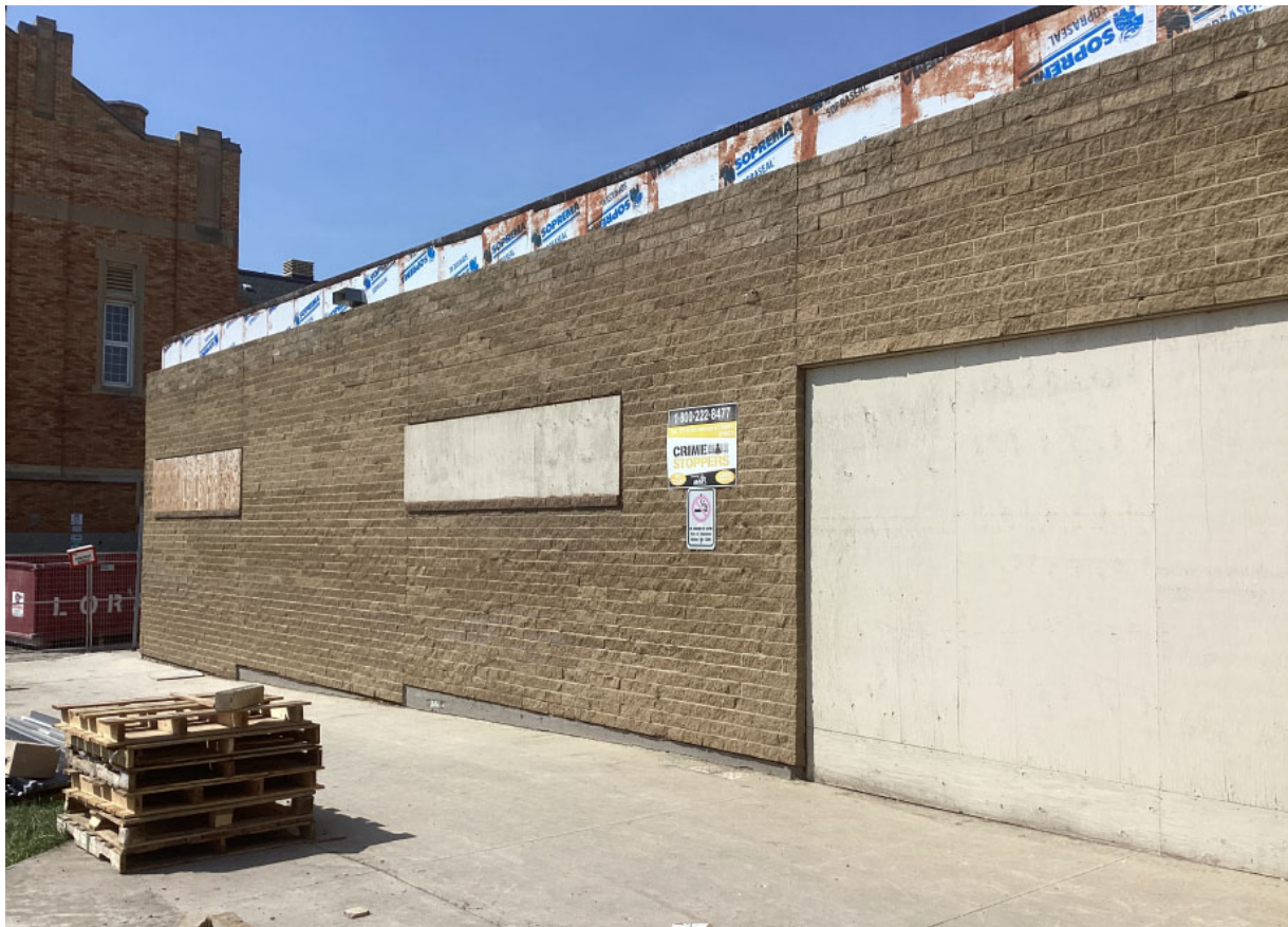
Roof membrane tie-in to existing wall membrane