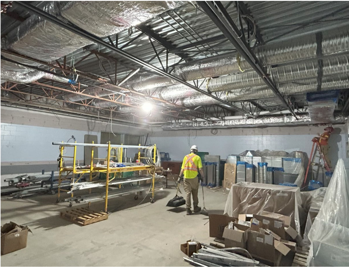
New HVAC installation in workout room, with transition from existing metal deck and open-web joists to new steel joists