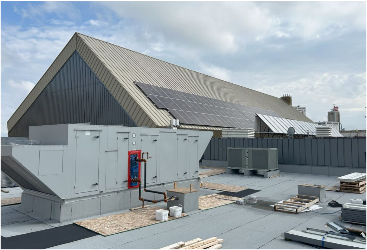
Ongoing exterior upgrades include new west flat roofing, rooftop HVAC units, metal cladding, and solar panel installation on the south roof