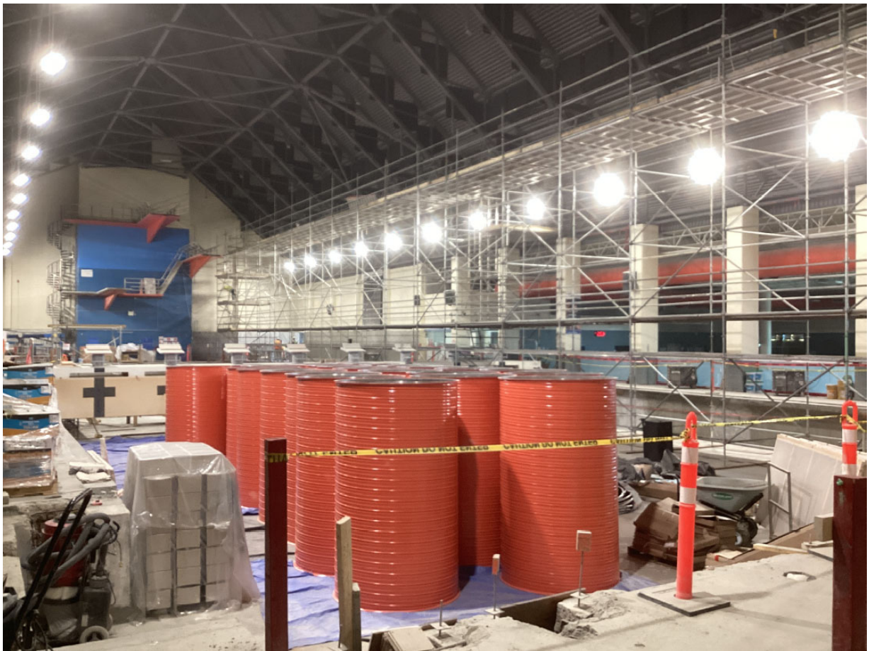
General site view: Pool HVAC units painted and staged for installation on erected scaffolding