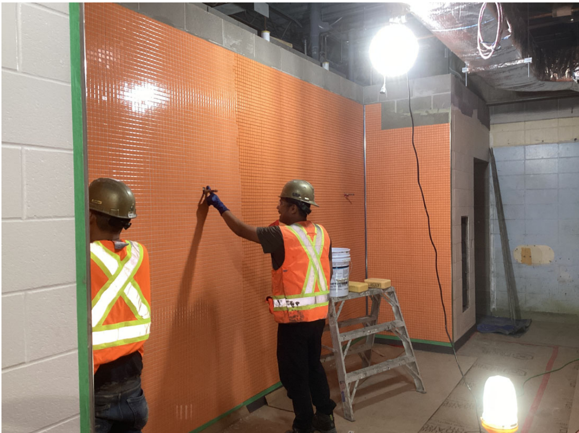
Female Change Room: Wall and floor tiling complete, with protective covering in place