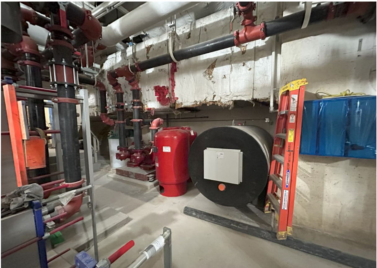
Boiler room: Installation of pool and mechanical equipment underway