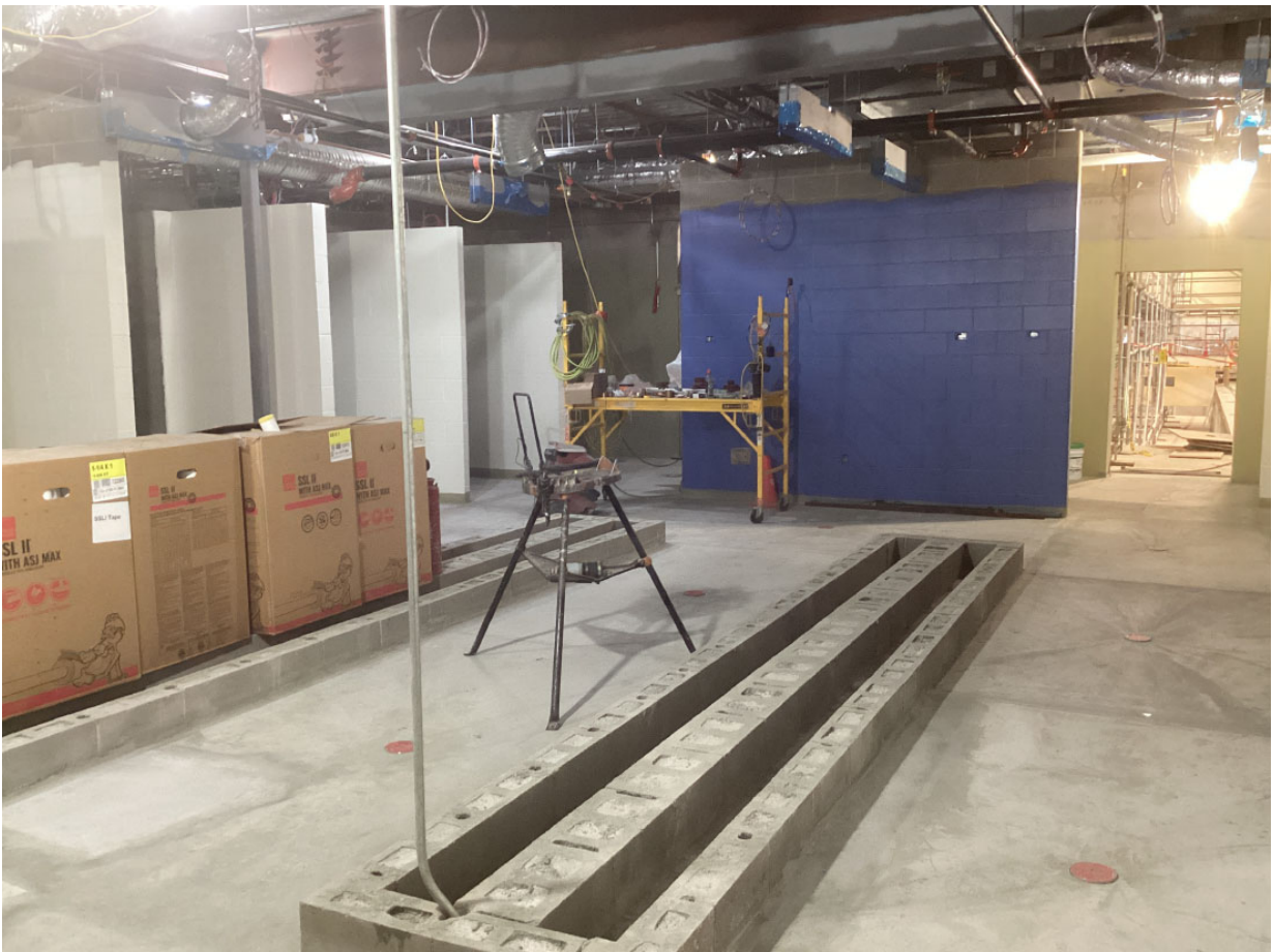
Universal Change Room: Masonry walls complete, locker bases installed and prepared for miscellaneous steel and tile installation