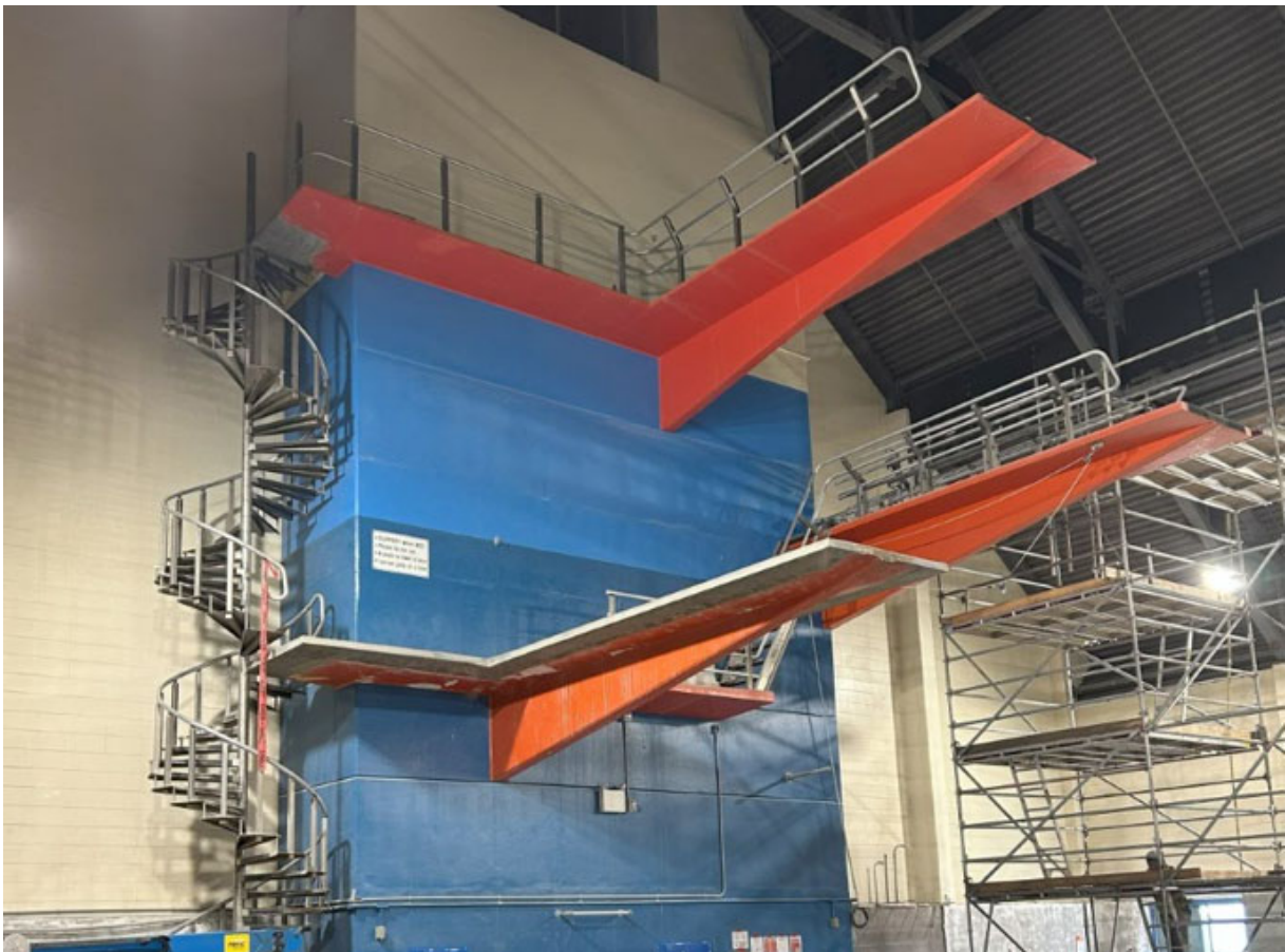
Diving Tower – Repairs completed on the 5m dive board platform and other areas of deteriorated concrete