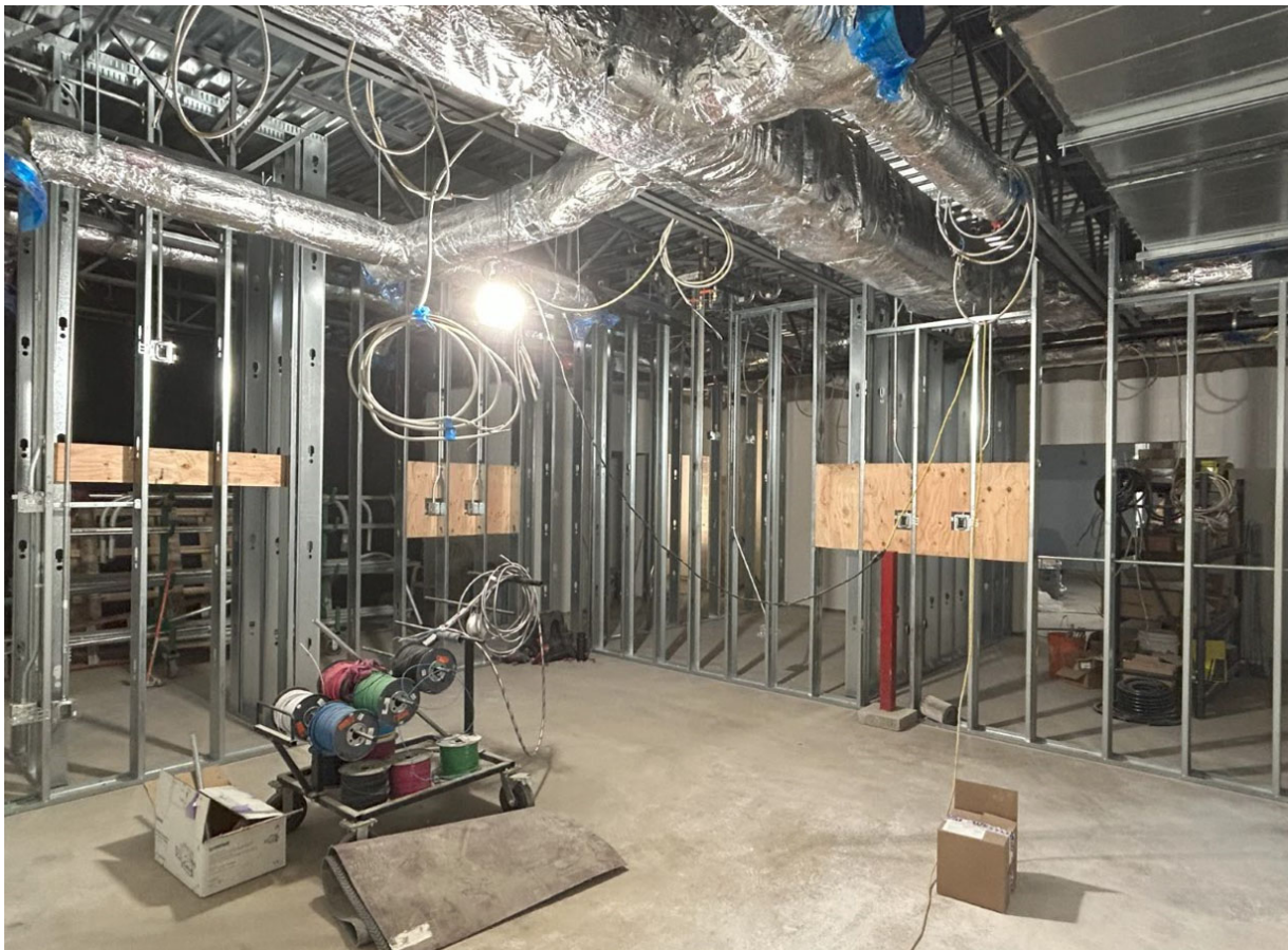
Steel stud framing in progress for new offices, meeting room, and staff room