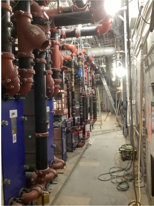
Boiler room: Installation of pool and mechanical equipment underway