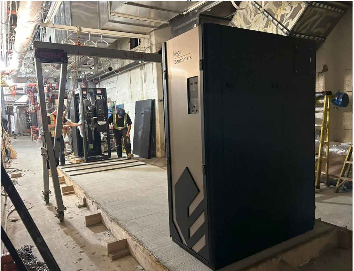
New housekeeping pad installed for new boilers; boilers being set in place. Large existing ductwork received new duct sealant and additional structural strut supports