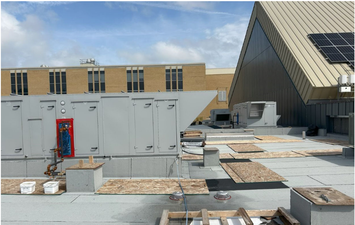
Ongoing exterior upgrades include new west flat roofing, rooftop HVAC units, metal cladding, and solar panel installation on the south roof