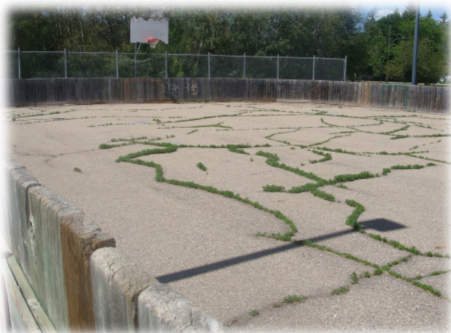
The inside surface needs some touch-ups.