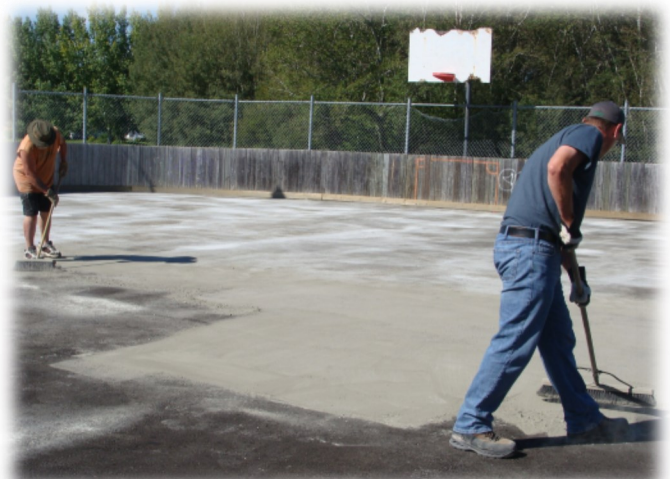
This looks much better.