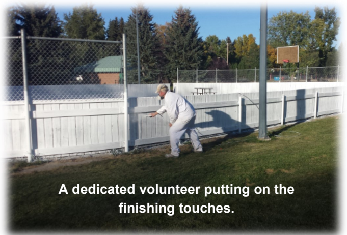
A dedicated volunteer putting on the finishing touches.