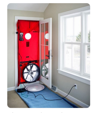
Figure 2: Blower door test

Before sealing any leaks in your home, it is important to have a registered Energy Advisor perform an EnerGuide audit, which includes a Blower Door Test, and determines how much air flows through your home. Airtightness is measured by placing a depressurizing fan inside one of the doors and pulling air outside of the