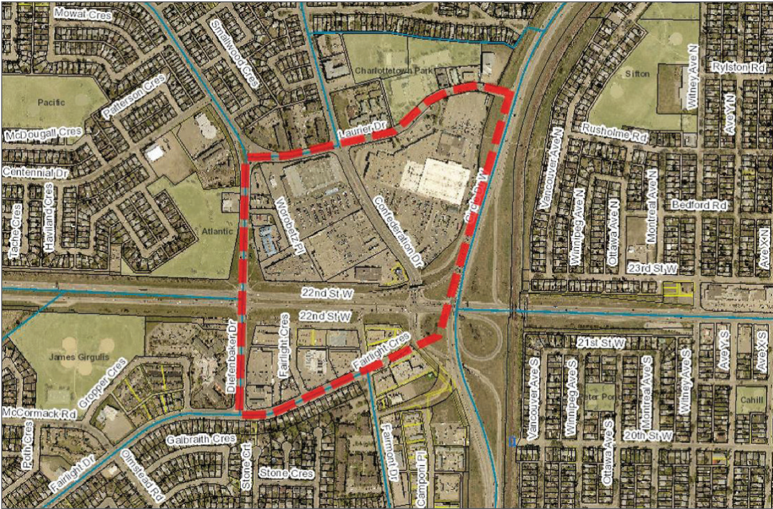
Confederation Suburban Centre – Project Area