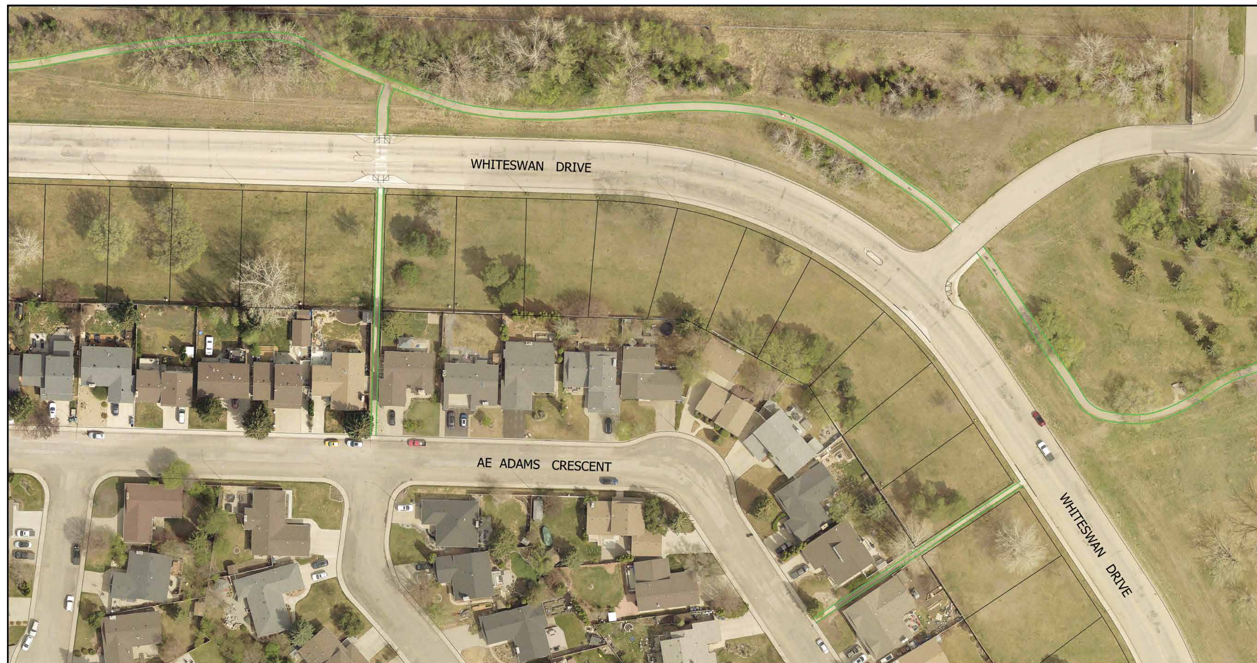
#471 Pedestrian Crossing Relocation